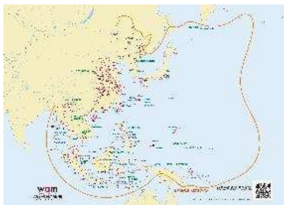
2. Color / unshaded